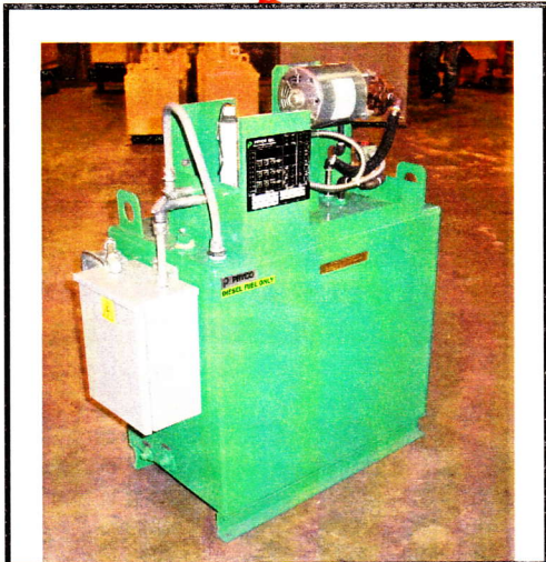
This PY25ULDW is equipped with our electronic FCM system. The enclosure on the left side of the tank provides an easy interface with a remote pumping unit and for power, etc. for this unit.