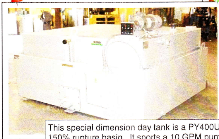
This special dimension day tank is a PY400UL with a 150% rupture basin. It sports a 10 GPM pump coupled to a 3/4 HP motor and a sight glass (option #326). The removable plug at the bottom center on the rupture basin is an access port to the lower hand valve of the sight