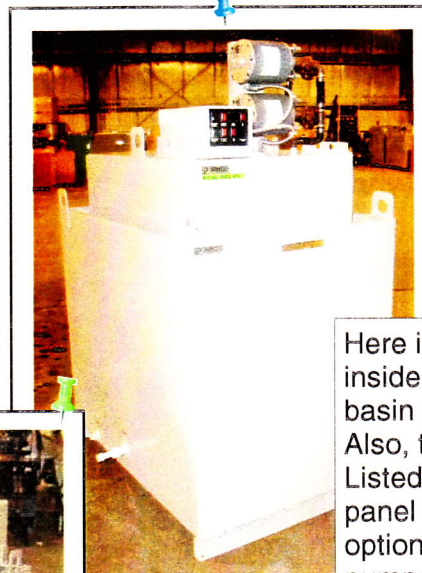
Here is a PY275ULDW inside a 150% rupture basin (option 385). Also, there is our U/L Listed enclosed control panel (option 465) and option 427A duplex pumps and motors. This system has two Option 295 leak detectors — one in the double wall area and the other in the rupture basin.